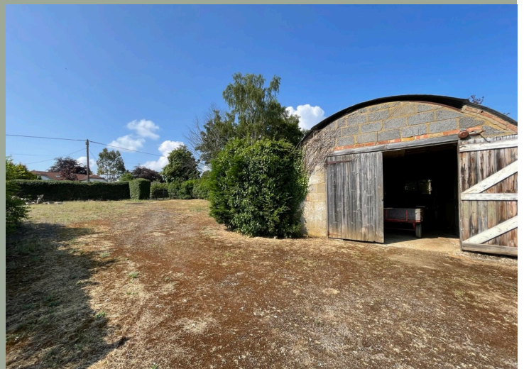
Foreground: Nissen Hut Background: parking lot and separate entrance