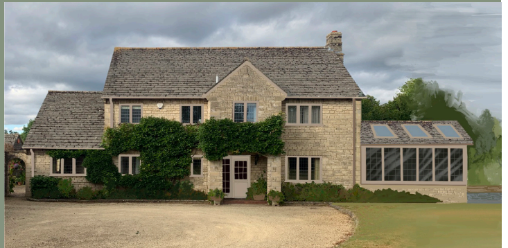
Rendering of possible conservatory conversion